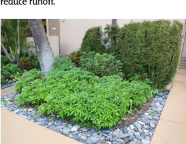
A landscaping feature at Maui Kai; no exposed soil was observed