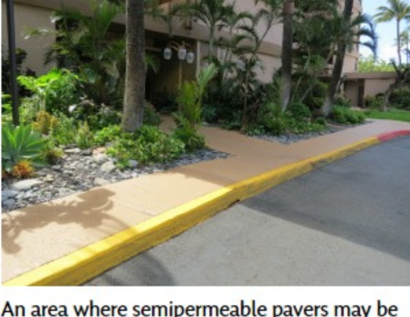
An area where semipermeable pavers may be used during a future renovation at Maui Kai