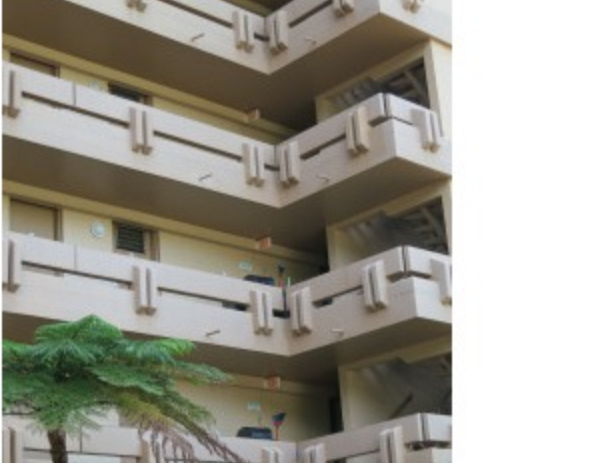
Downspouts from Maui Kai all direct into vegetated areas, ensuring the water is used for plants and does not end up as runoff.