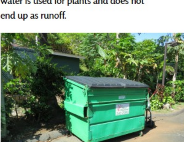
A closed dumpster on Maui Kai's property, which ensures that materials from spills won't end up included in runoff in the event of rain.