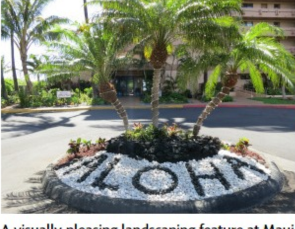
A visually-pleasing landscaping feature at Maui Kai that uses very little water.