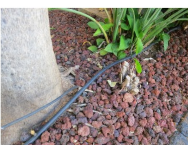
Drip irrigation at Maui Kai that reduces water usage, and rocks used to cover bare soil and reduce runoff.