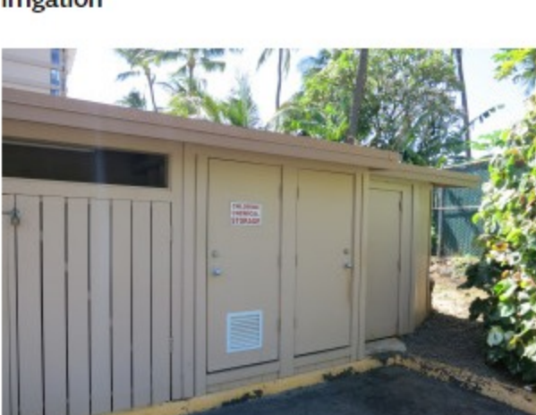
Maui Kai stores its chemicals in a contained area.