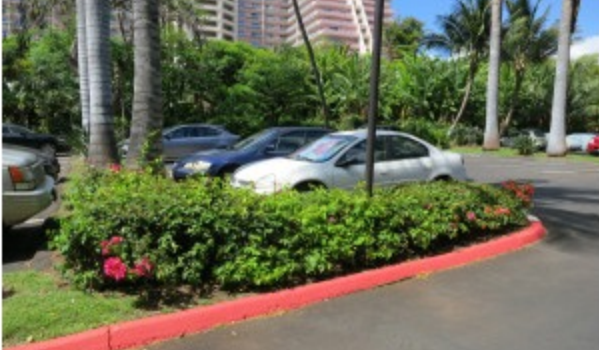
An area where semipermeable pavers may be used during a future renovation at Maui Kai