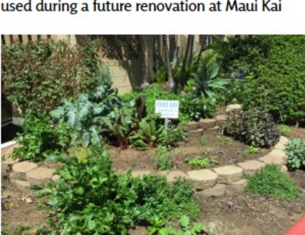
Maui Kai's community garden, watered with drip irrigation